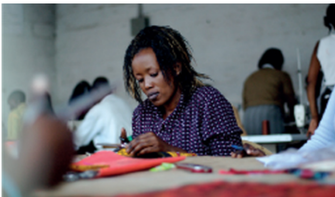
Trade Map's Company Data help SMEs reach out to potential trade partners in more than 60 countries.

Every day, ITC Tools helps SME users make efficient trade related decisions which bring about job creation and sustainable development