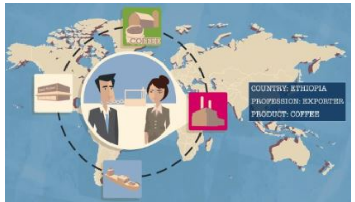
Watch how ITC's Market Analysis Tools empower SMEs around the world to make better trade related decisions ( http://tinyurl.com/kea6yki )